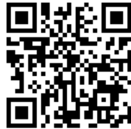
Fun at NCKU